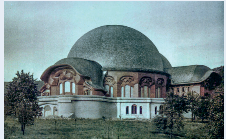
The First Goetheanum nearly completed opened September 20, 1920; burnt down December 31, 1922.